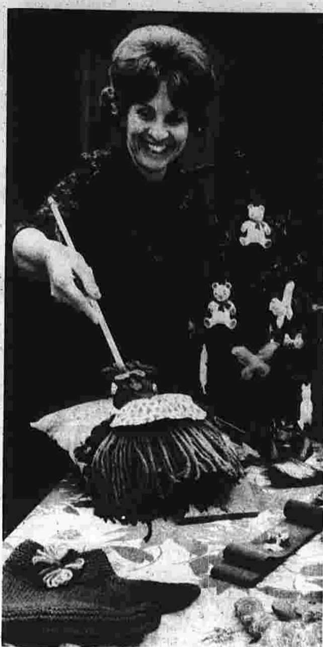
Coventry Plans Holiday Fair