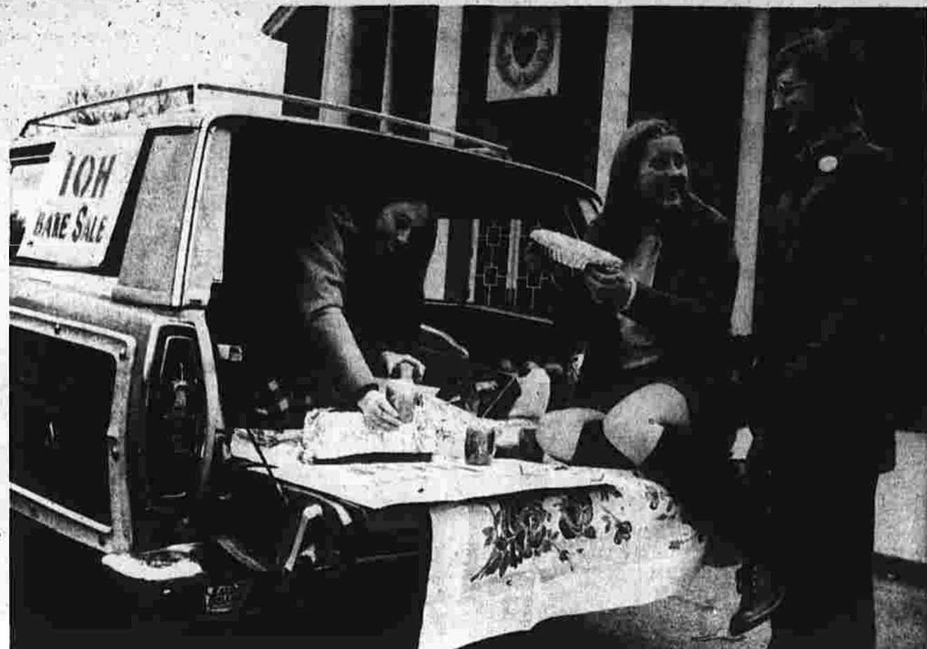
IOH Mobile Bake Sale Saturday